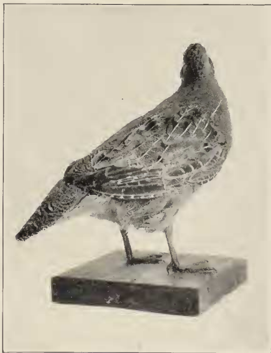
Mounted Hungarian Partridge Side View

to adjust themselves to the presence of other birds of this nature. Importations of the species have been carried on in Canada for the past twenty years and observers there certainly must be in a position to know whereof they speak when it comes to a discussion of the Grey Partridge, as the bird is invariably referred to there. The Canadian Field-Naturalist (Ottawa) has recently published some excellent material on the subject of the introduction of foreign species of game birds, and I should like to quote one or two of these articles relative to the species' ability to get along with other varieties.